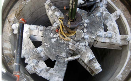
Breakthrough of a 6.3m diameter reamer into the shaft collar.