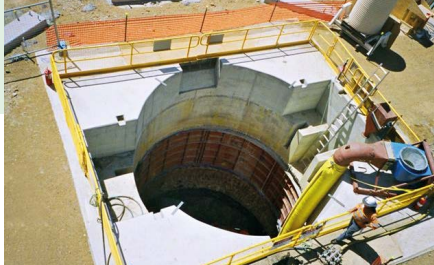
Shaft collar for a 6.3m diameter raise bored shaft.