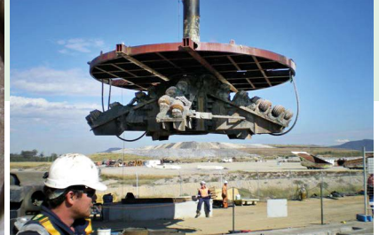
Reamer removal showing the use of a "false floor" providing safe working procedures.